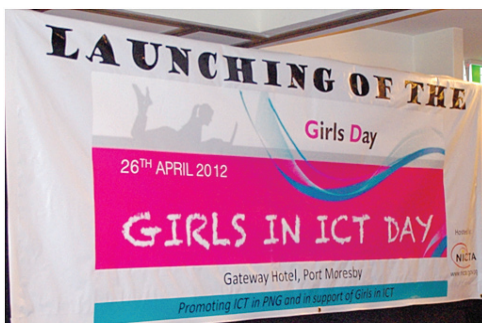
2012 – Launching of the International Girls in ICT Day;

In our efforts to localize this International Day, we have been undertaking various activities such as essay competitions, awareness programs, open days, supporting the GirlsInICTech Week and providing scholarships under our NICTA GICT Tertiary Scholarship Programme; all these are depicted in the pictures below to show the journey of NICTA in promoting the International GICT Day thus far.