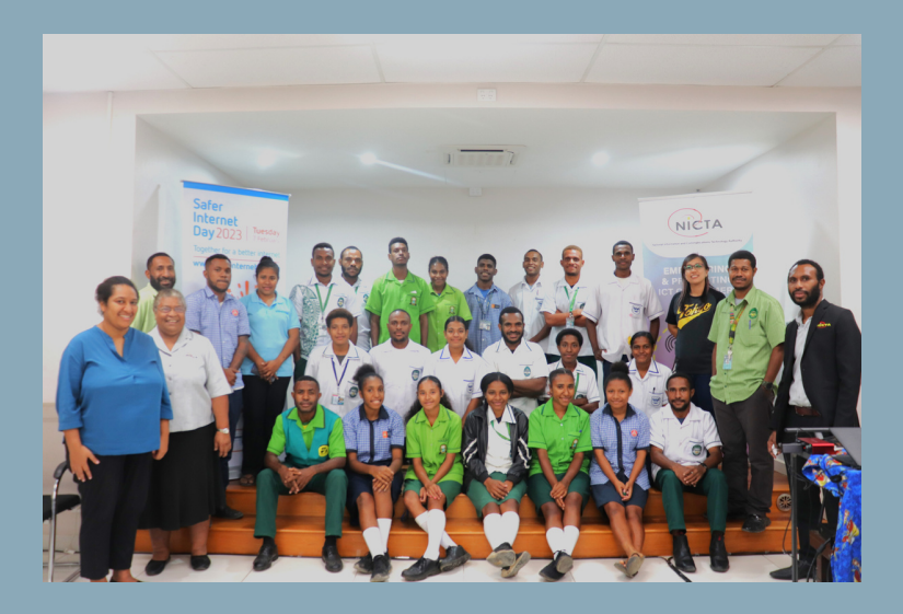
Caption : Consumer Affairs Branch with NCD participating schools in the 2023 Safer Internet Day School Ambassador Program