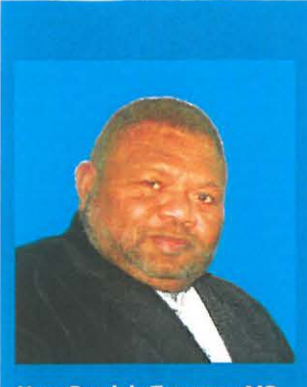
Hon. Patrick Tammur MP Minister for Communication and Information