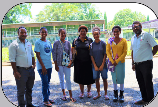
NICTA Scholarship Committee in Lae, Morobe Province during the sign-on for new scholars in 2023

Four scholarships for this year are now into its final stages. shortlisting has been completed and winners will be announced in quarter two (Q2) this year.