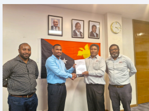
NEW STAFF JOIN EXUCUTIVE MANAGMENT