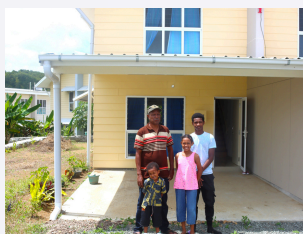
NICTA HOME OWNERSHIP