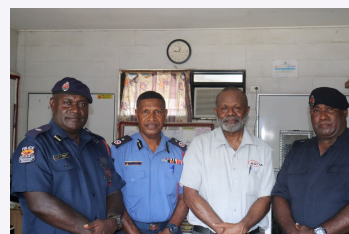
CALL CENTRE FOR ENB POLICE