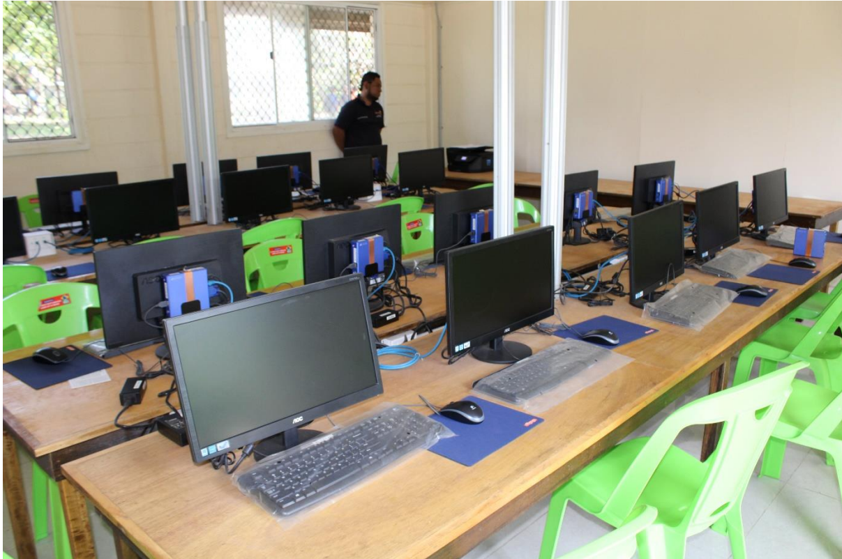
Image 2: Allan Jones Primary School ICT learning Centre funded by the UAS Fund.