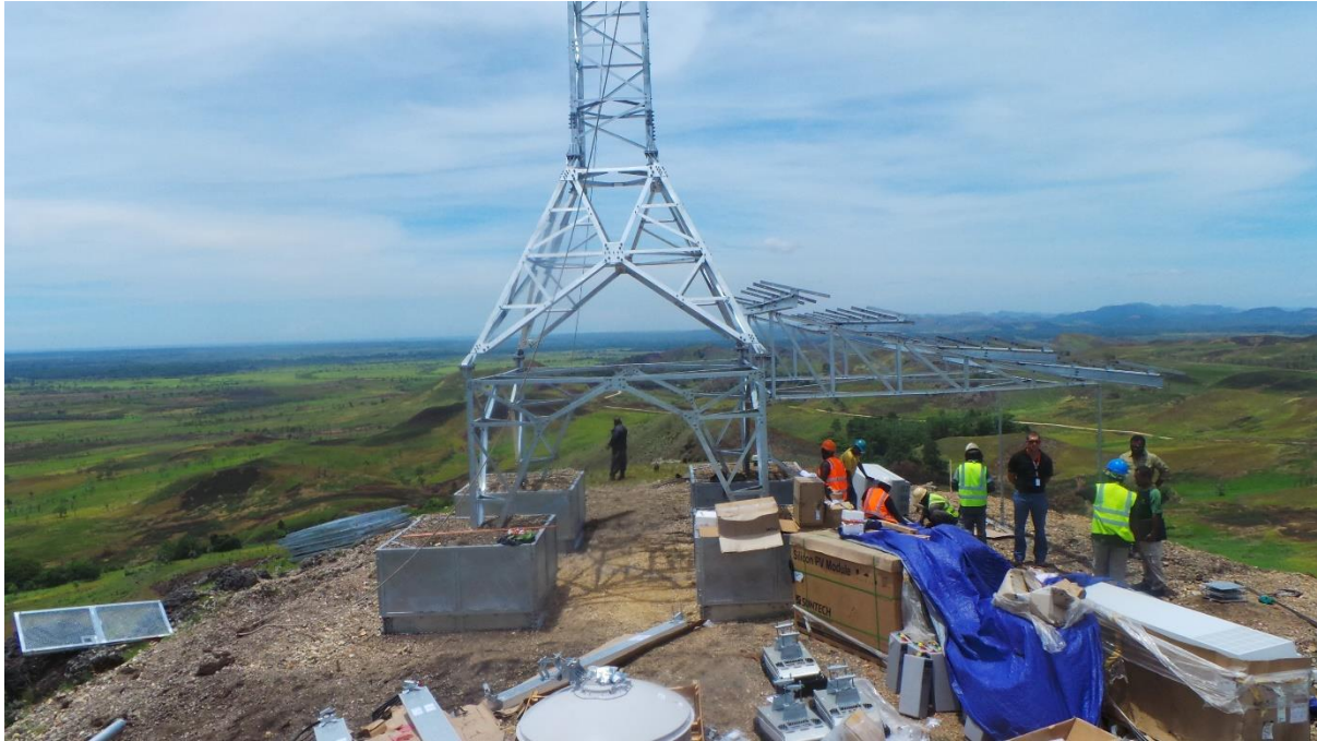
Image 1: Mobile tower under construction at Kore, Central Province.