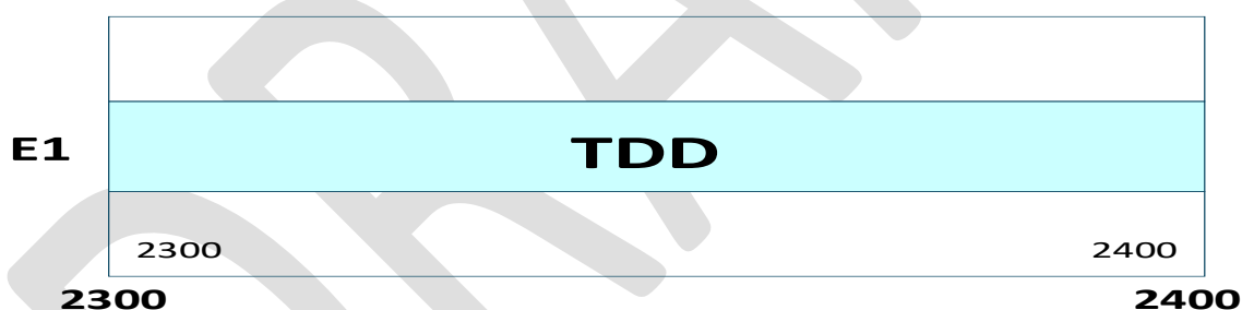
Figure 1: Frequency arrangement E1 (ITU-R M.1036-8)

3.2 Channelling arrangement is based on 10 MHz block for deployment of IMT services. Multiples of 10 MHz contiguous spectrum can also be used depending on spectrum availability and specific requirements. Ideally 40 – 100 MHz of contiguous spectrum is required to support high capacity TDD services.